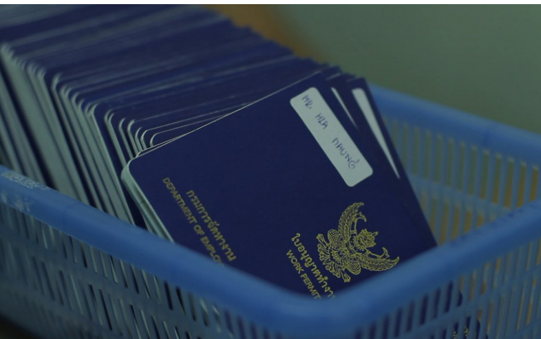
Retained worker passports, Thailand.

The Clauses are modular, meaning they are designed to be selected, edited, and adapted by adopting companies. As such, the Clauses are not a one size fits all, and simple copying and pasting should be avoided. Rather, the Clauses should be selected and tailored by internal and external counsel according to the specific needs of the contracting parties as part of the companies’ due diligence processes.