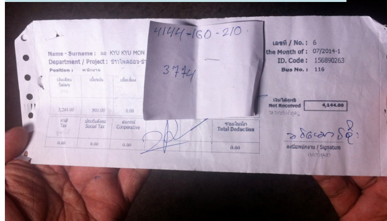
Worker paystub indicating unsanctioned deductions by employers, Thailand.

Most traditional contracts rely on unrealistic promises of perfection and often place the supplier in breach of contract on day 1; these are out of sync with the HREDD approach.